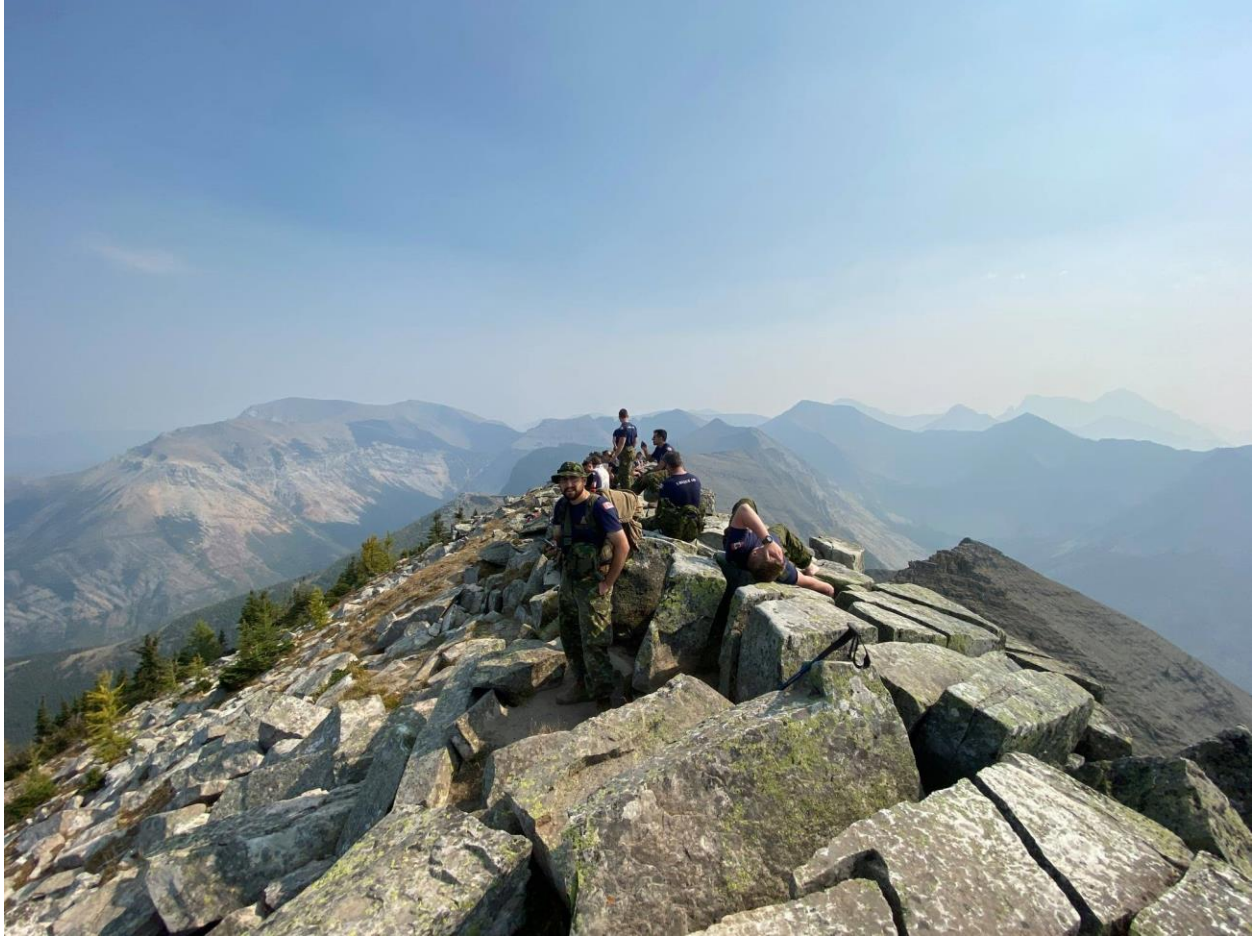
Gunners from 20th Independent Field Battery (20 Ind Fd Bty) rest at the top Vimy Peak in Waterton National Park on Exercise VIMY GUNNER on 8 September 2021. Exercise VIMY GUNNER was 20 Ind Fd Bty's event to mark UBIQUE 150.

The view at the top was undeniably worth the arduous journey. The highlight of this adventure training was watching two highly deserving soldiers promoted on the summit of Vimy Peak. After a brief celebration atop of the windy mountain, the hikers made their descent down the hiking trail. The journey down the mountain was discernably quiet compared to the first leg of the adventure.