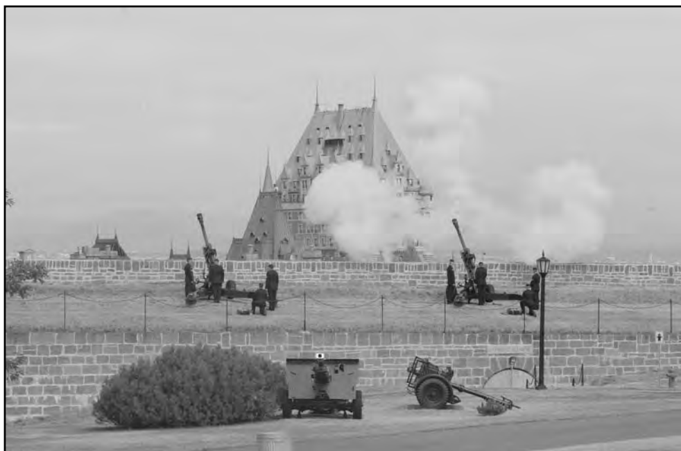
La troupe de Salut de la batterie R en action à la Citadelle de Québec.

l'occasion de la fête du Canada. Cette même batterie, qui était au rendez-vous quelques jours auparavant pour le concert sous les étoiles, devait en ce 1er juillet tirer 21 coups de canon à la Reine. Le Régiment a ensuite participé à une parade de changement de commandant de la brigade alors que le