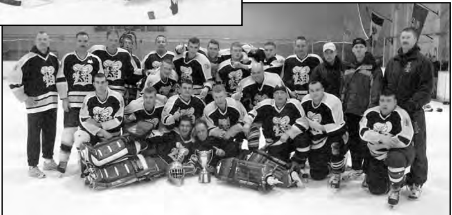
Right: B Bty wins the Kingston Cup and bragging rights for at least a year.