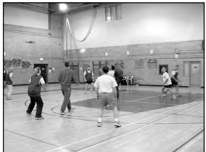
210 WKSP & 119 Bty in competition during Regimental RV.

Annual and collective training was tested one last time during EX ROYAL FIST, which saw an ADATS Troop being deployed in a Btl Group environment, during a live