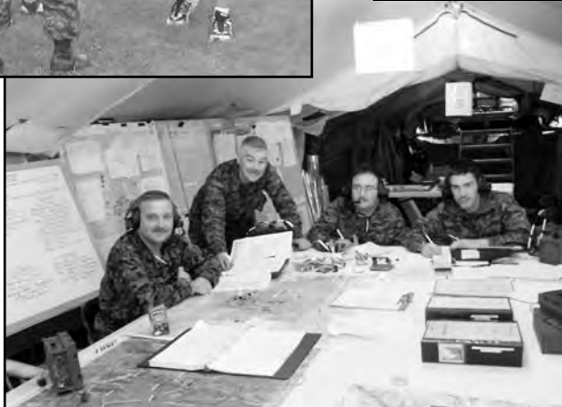
Above: C/S 0, the nerve center, is all work and no play during Op GRIZZLY.