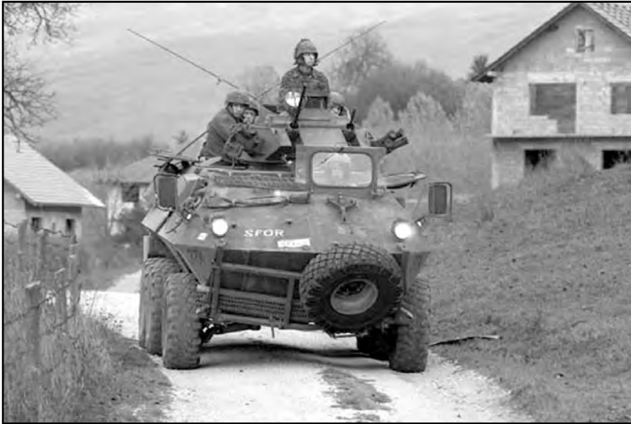
La Batterie R assure un environnement sécuritaire en effectuant une de ses nombreuses patrouilles montées à bord d'un Grizzly dans les campagnes entourant la ville de Glamoc.

Enfin, le 23 septembre 02, le Régiment a participé à une journée sportive alors que tous les membres ont pu choisir entre un tournoi de golf, de balle-molle ou de soccer. Des commanditaires ont même participé au tournoi de golf permettant ainsi aux participants de gagner certain prix de participation. En ce qui a trait à l'entraînement, le mois de septembre marque le début de l'OP GAUNTLET dans le cadre de la FRI(T) (Force de réaction immédiate (Terre)). Afin de participer à cette opération, l'entraînement des membres de la Bie R a débuté au mois de septembre en vue d'être déclarée opérationnelle (CAPOP) le 1er juillet 2003.