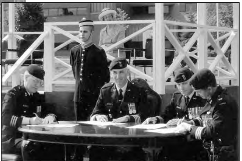
The signing of the Change of Command Scrolls.