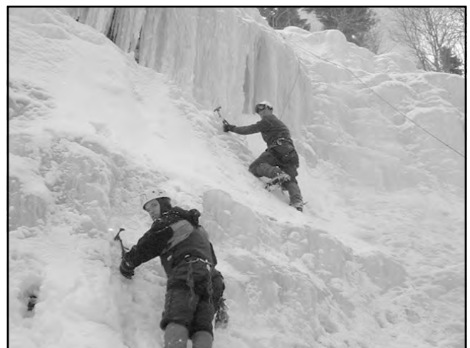
Gunners ice climbing during Adventure Training.

these highly sophisticated equipments. Of significant note, during 2002, a Service Level Agreement with the