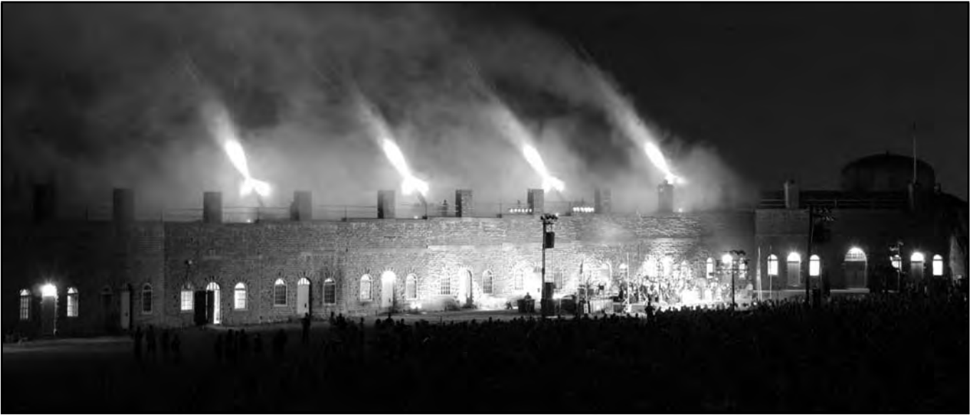
Concert au Crépuscule- Le 1812 avec les canons du 6 RAC

Le 17 août, nous tenions notre troisième édition du concert sous le crépuscule. Une foule de 7 000 personnes fut rassemblée dans l'enceinte du Fort Lévis-Lauzon alors que 3 000 personnes s'étaient installées dans des endroits stratégiques à l'extérieur du Fort. Cet événement s'est mérité le prix spécial du jury lors de la cérémonie du Grand Prix du Tourisme de Québec.