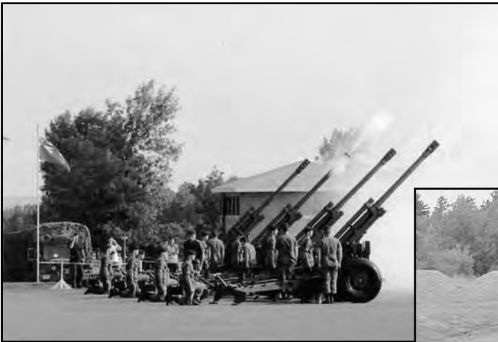
The blast as W Bty Salute Troop fires a Regal Salute.

School, as the Centre of Excellence for Artillery training and the development of Artillery tactics, techniques, and procedures, will lead by grasping this opportunity and moving forward into new areas that will make the Canadian Artillery more robust and relevant in all operations. Integrating new ISTAR doctrine with current fire co-ordination and targeting processes will also be pursued. Getting this aspect right will be critical to ensuring that the Artillery can win the stand-off engagements that are essential for success on future operations. For the Air Defence Artillery, the School will concentrate on improving situational awareness to enhance future operational capability. Firepower, in conjunction with information operations, will be the decisive factor in future operations, and the School will lead the way by developing new career structures and training methodologies and new more robust, more relevant, organizations and tactics. Beyond a doubt, the exceptional and versatile Gunners of the Royal Canadian Artillery School will capably meet all challenges.