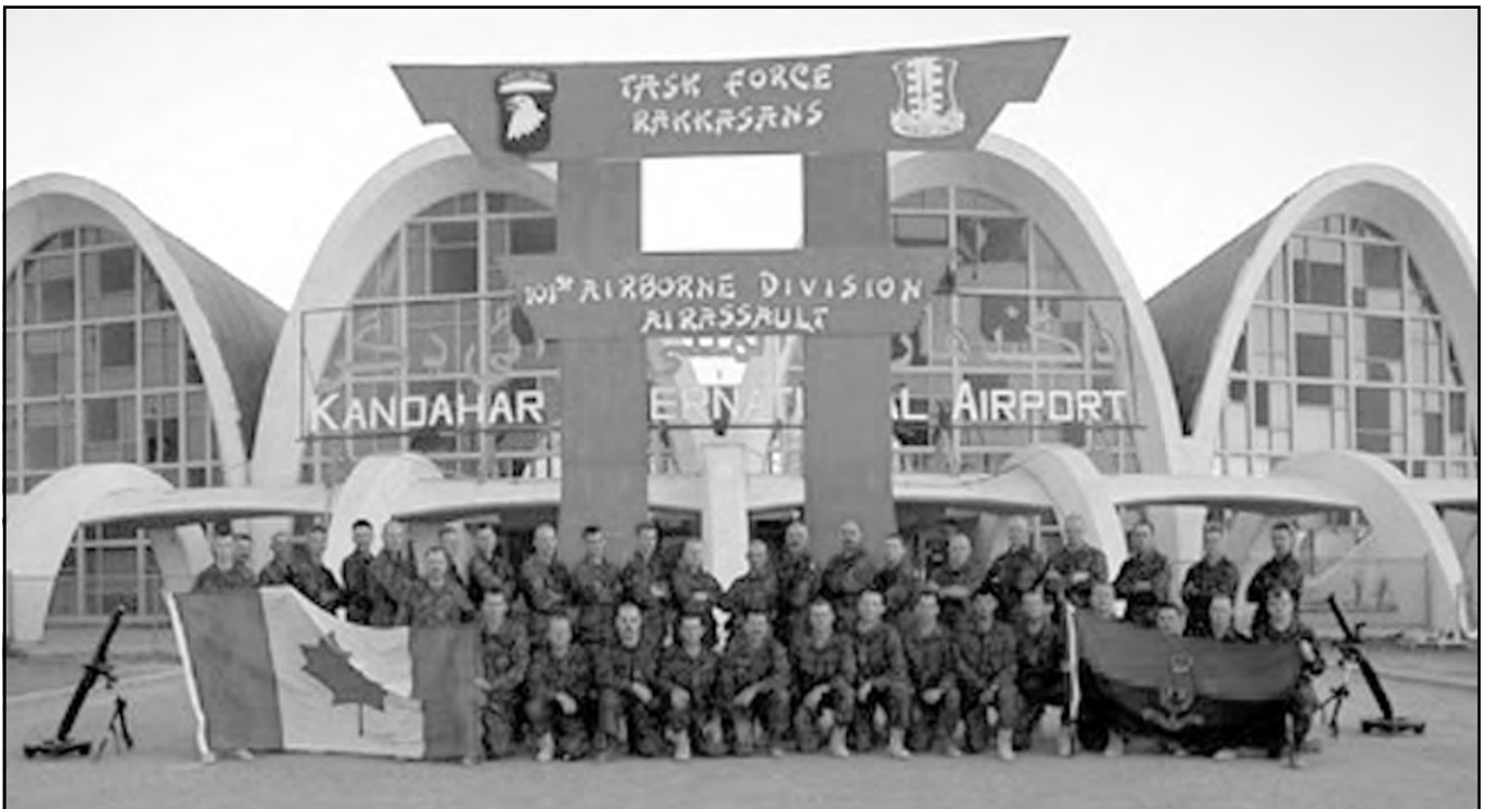
Members of the C Bty Mortar Platoon pose in front of the Kandahar International Airport main terminal building during Op APOLLO.

During the deployment, Canadian soldiers earned the admiration and respect of our American Task Force, the Rakassans. The Canadians became the "go-to" Battle group within the Task Force. Further operations followed, allowing members to see the greatly varied landscape that Afghanistan had to offer; from the dry desert plains in the south to the snow-capped mountain forests of the north.