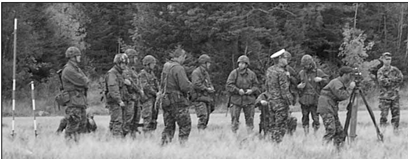
Briefing for the Arty Tech Supervisors Course.

Much like the other Batteries at the School, Gunnery Training Battery experienced a busy and eventful year. The