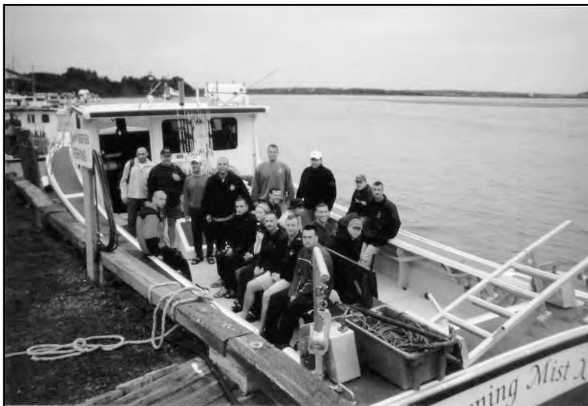
Gunners from W Bty prepare to fish during EX Aquatic.