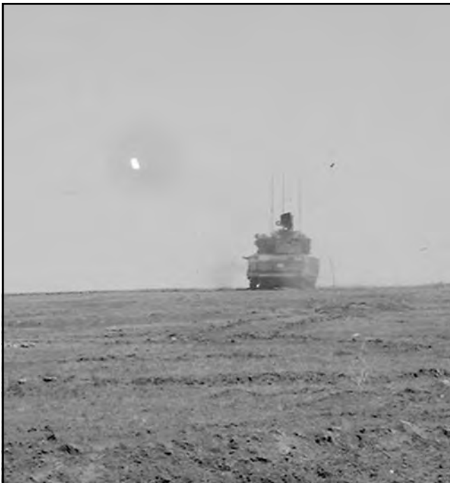
An ADATS fires a msl at an aerial tgt during PK 02.

successful simultaneous engagement of one target by two ADATS missiles.