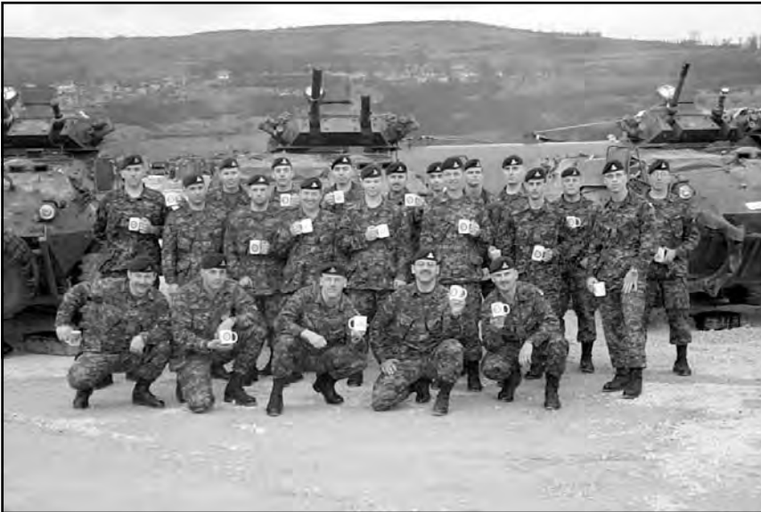
Roto 9 Platoon shows off Tim Hortons mugs sent from home.

Although the previous exercises were challenging, they cannot be compared to the unit's participation in Ex NIMROD GALE. The grueling final exercise for the Bty Comd's Crse was held in mid April. This exercise was a challenge for everyone in the unit due to its nature and range restrictions. Most of the roads were washed-out or buried in mud, this brought valuable training for the Recce Elements. Although, we didn't know it at the time it allowed for valuable work up training for our future deployment. Then, with just enough time to knock the mud off our boots, the Regiment headed for what it hoped would be sunnier destinations, Bagotville Que. Exercise AMALGAM allowed for the continuation of Det development against high performance military aircraft and the Bty CP had their first interaction / amalgamation with the Air Force in preparation for OP GRIZZLY.