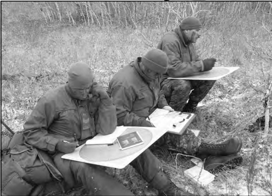
Left: Who needs a vehicle? A Command Post - C Bty style, during Ex MORTAR MANIA.