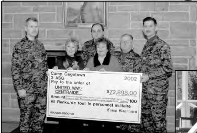
United Way cheque presentation.