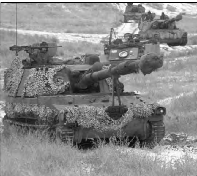
Above: B Bty getting to know ever inch of the Suffield training area during Ex PACING RAM.