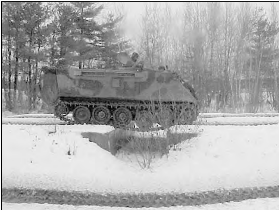
New drivers practicing during the light track course at the School.

2002 proved to be as challenging and diverse a year as any of the previous for W Battery. The Battery sup-