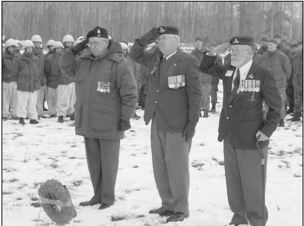
Canoe River Ceremony.

As I look back at the year's activities, and where the Regiment is today, I see the same circle of fury and chaos that I am proud to call home.