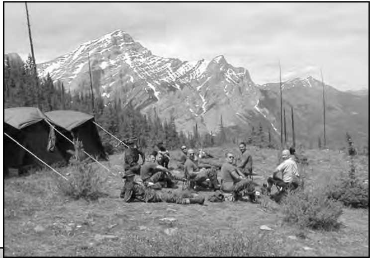
Above: Observation Post 22 enjoys their panoramic view of the Kananaskis Mountains during Op GRIZZLY.