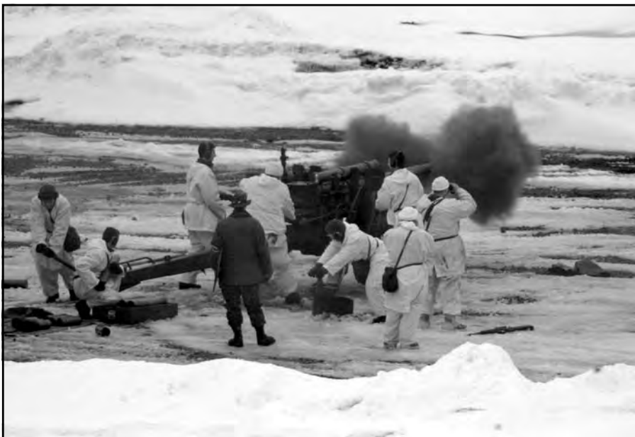
Détachement du Sgt Coulombe 55C lors du tir direct à B.F.C Valcartier

L'année 2002 fut très active pour les membres du 6e RAC. Nous avons effectué cinq exercices de tir et tiré plus de 750 obus de tous types. Deux de ces exercices ont été réalisés sous la formule d'exercice de partenariat réunissant le 2 RCA, 6e RAC, 62e RAC, 58 BAA et le 5e RALC, deux autres exercices furent des exercices de batteries et le cinquième fut une concentration estivale de tir réel.