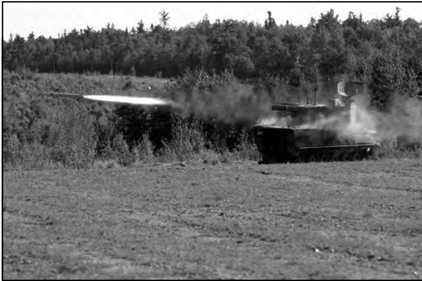
ADATS fires at a ground tgt during Ex STAUNCH GLADIATOR.

To end another year, the Regiment celebrated St. Barbaras's Day with the annual RV weekend, which brought all of the members of 4th AD Regt from Cold Lake AB and Moncton NB to sunny CFB Gagetown. There was competition and comradery at all levels on and off the sports fields, as well as re-acquaintances and reunions of old friends.