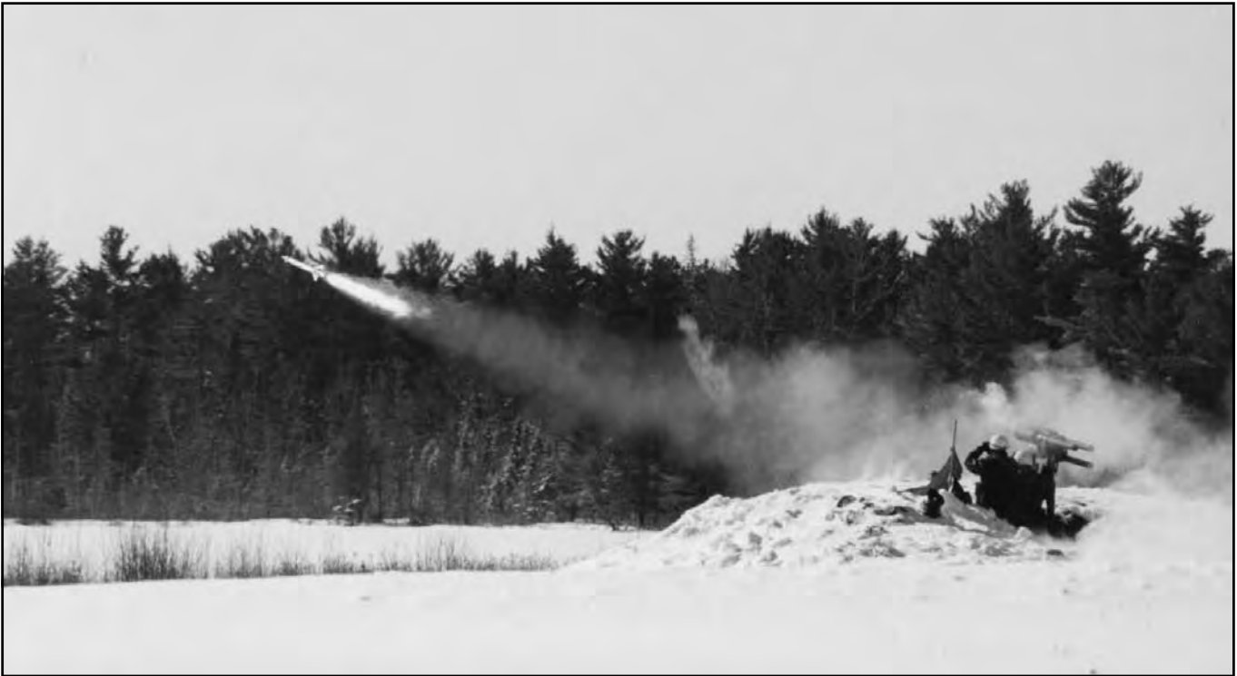
A detachment from A Trp engaging an aerial target during BLAZING ARCHER.