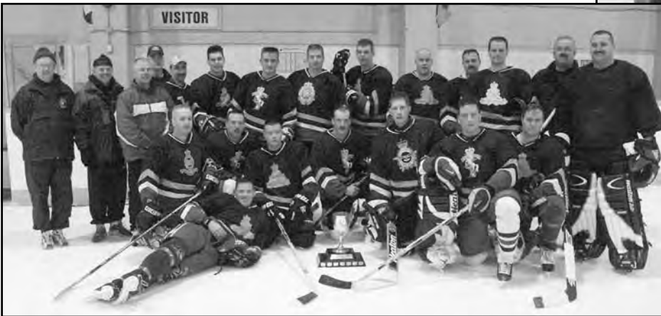
Above: HQ & Svcs Bty takes home the Hugsweier Cup during the Regimental St Barbara's Day festivities.