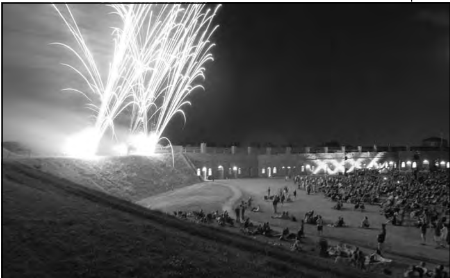
Concert au Crépuscule au Fort no de Lévis- La grande finale