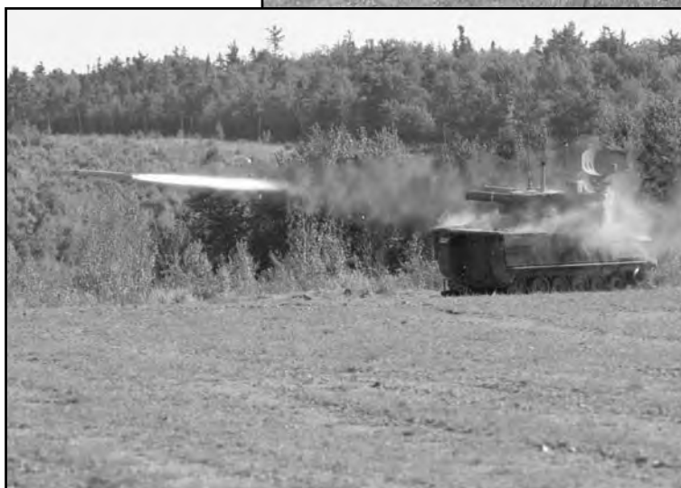
The ADATS firing at Staunch Gladiator.