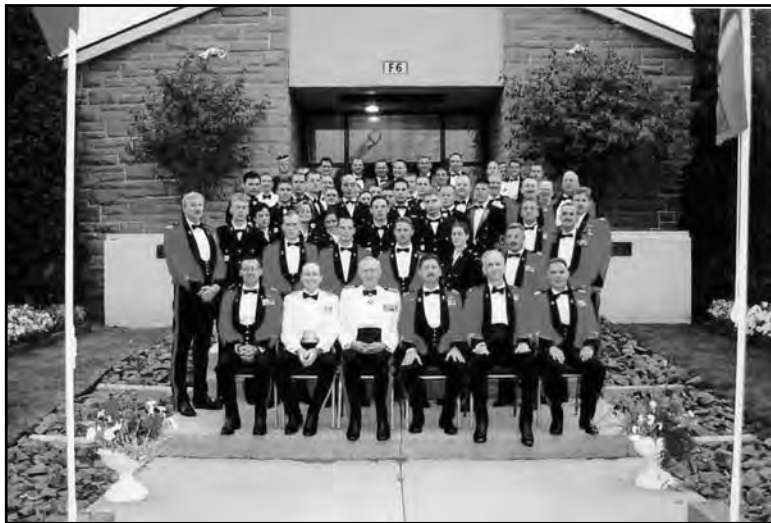
Guests at the Basic Artillery Officer Mess Dinner.

Phase III and IV Basic Artillery Officer Courses were run from end May until the beginning of August. The fall also saw 12 Assistant Instructors-in-Gunnery (Field) graduate and join the bullpen. The Qualification Level 6A Course graduated 21 students in November. Over the same time period, an Artillery Technical Supervisor's Course was run with thirteen successful students. The Air Defence bullpen was no less busy with their myriad of courses. There are currently six students on the Assistant Instructor-in-Gunnery Course, which began in August. Both the NCM Development Period 1 Course and Air Defence Sergeant's Course graduated 12 students. The Air Defence Officer Phase III saw 10 new qualified officers graduating, along with six who made up some missed training from the previous year. The Air Defence bullpen conducted Instructor-in-Gunnery assistance on two major missile firing camps. In June 35 missiles were fired with the assistance of the School on Exercise PERFECT KILL 02 to prepare 4 Air Defence Regiment for their duties at the G8 Summit. 58ieme Batterie took part in Exercise BLAZING ARCHER firing 22 missiles and making nine direct hits. Altogether, it was a busy and successful year for Gunnery Training Battery.