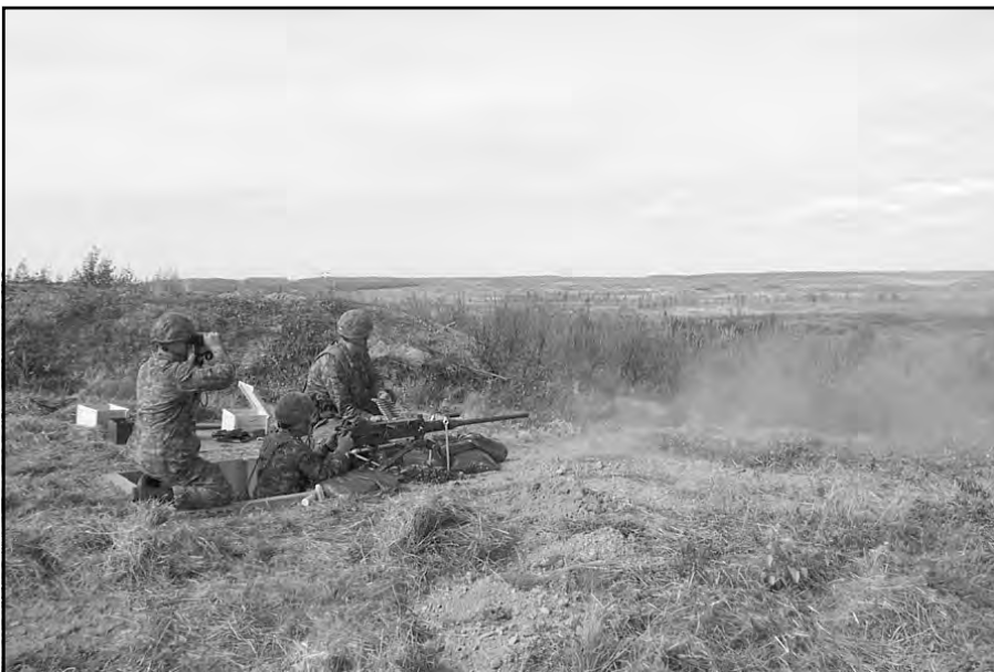
Students from the Fd 6A Course on the range.

W Battery's Field Troop is always a busy place, and this year was no exception. A myriad of national courses