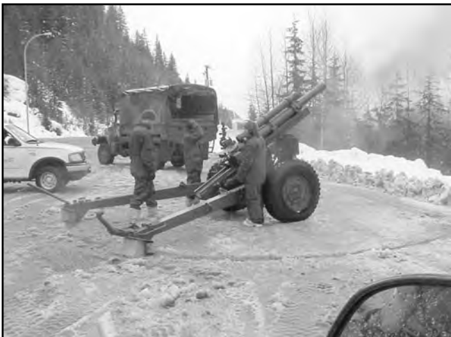
A Bty keeps the mountain pass open during their AVCON tour.

The First Regiment had a momentous 2002. It participated in many of the things it does each year. To not mention something does nothing to lessen its importance. Every day of the year, someone from 1 RCHA is doing something that makes a difference; be it volunteering as a coach for youth soccer within the community or by maintaining a NATO presence as part of an international peace-keeping operation. There is not enough room in this entire publication to identify everything that went on with 1 RCHA and its members this year. At the end of the year, after the traditional hockey games and the Christmas dinner, a much-earned break was taken. A break from one of the busiest years in the history of the Regiment.