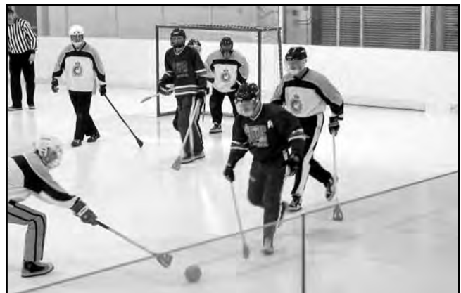
1 RCHA Broomball Team battles it out with 1 Svc Bn during Ex STRONG CONTENDER.