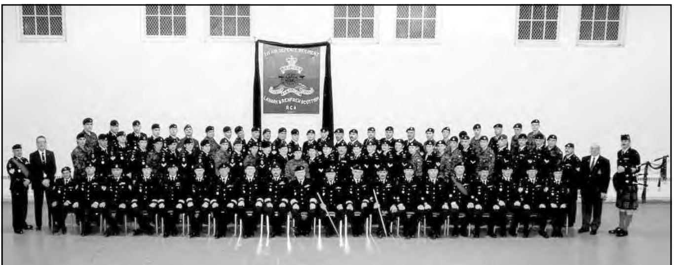
1 AD Regimental picture at the Soldier's Christmas Dinner 2002.