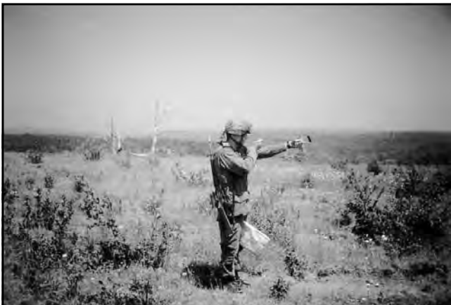
Ph III Student on Recce.