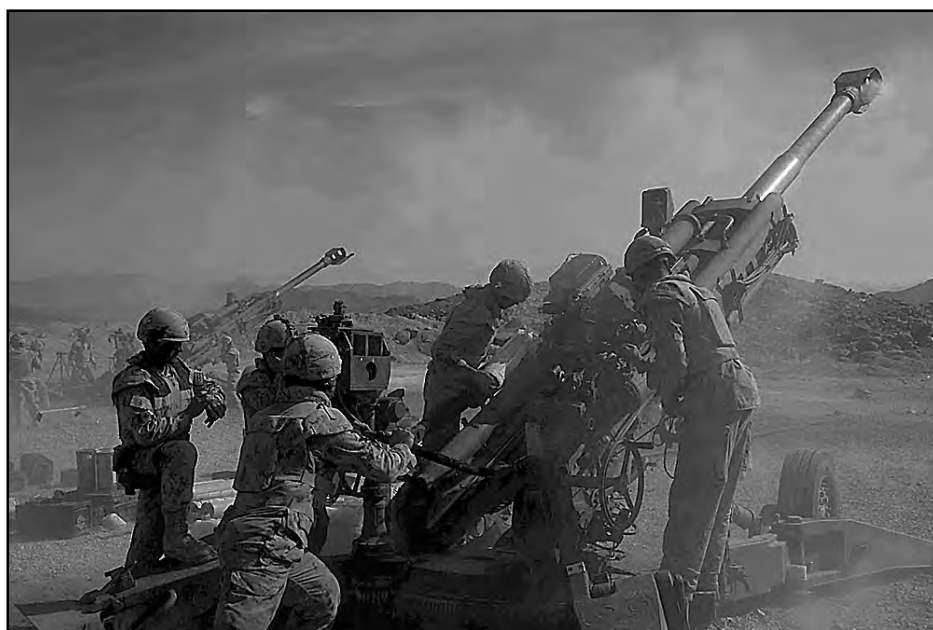
M777 en Afghanistan.

En conclusion, le 5 RALC a été marqué de plusieurs événements notoires au cours de l'année. La dynamique de ce régiment est au niveau des plus intenses. Que ce soit pour les membres du Régiment déployés en théâtre hostile et loin de leurs proches ou les ceux qui font des pieds et des mains pour qualifier un maximum de gens sur nos systèmes d'armes, tous se rappellent que nous formons une famille et que nous travaillons conjointement afin de représenter les valeurs canadienne au pays et ailleurs.