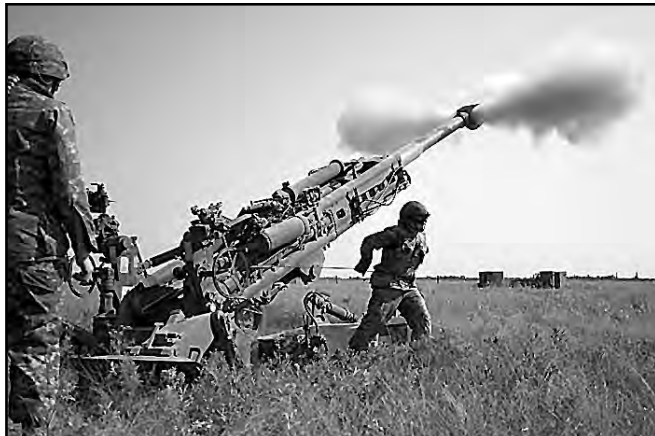
D Troop defends the Gun Line.

After returning to Shilo, B Bty took Christmas leave, which for many would be the last chance to see their families. Everyone returned refreshed and eager to deploy. The Battle Group continued with finalization training which included cultural