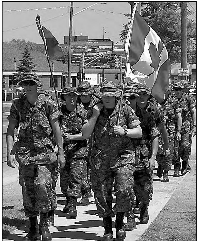
Nijmegen Team workup.

As the only Ground Based Air Defence unit in Canada, 4 th AD Regiment, RCA has risen to meet all of the challenges it has been presented with. Whether supporting operations or training exercises, 4 AD Regt has been a beacon of professionalism within the CF. In 2008 the Regt will be fielding the 400 series ADATS, Bison ASCC and associated communications equipment, while continuing to provide ASCC's for TF Afghanistan, augmenting the TUAV tp, and continuing to support the RCAS and CF in Domestic Ops and Operational deployments.