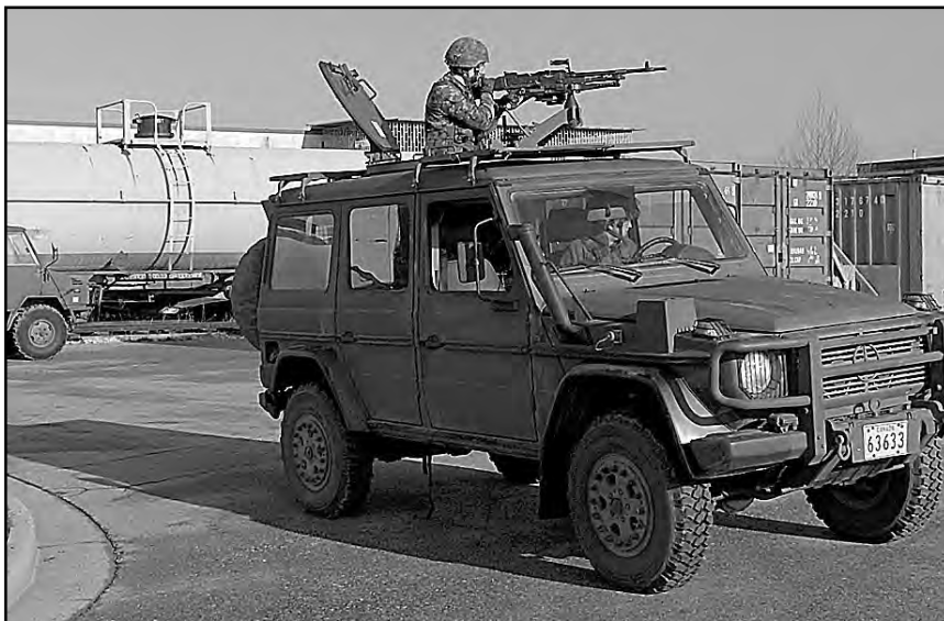
Convoy Ops Train-

On Remembrance Day, 39 CBG again provided it's traditionally large contingent to the City of Vancouver parade. The Regiment fired the salute from Portside Park overlooking the Harbour and in view of the North Shore mountains, and then conducted an Artillery Roll Past on the Parade Route.