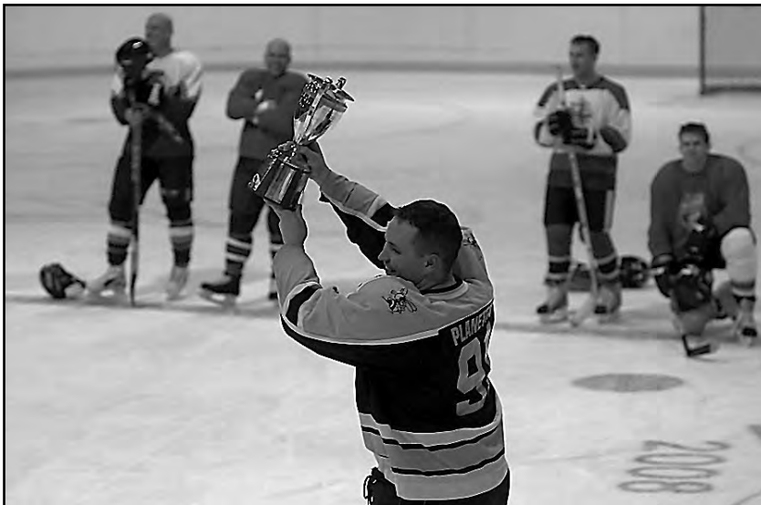
B Bty wins the Kingston Cup.

With the onset of summer leave, all members of B Bty were able to spend much needed time with their families and