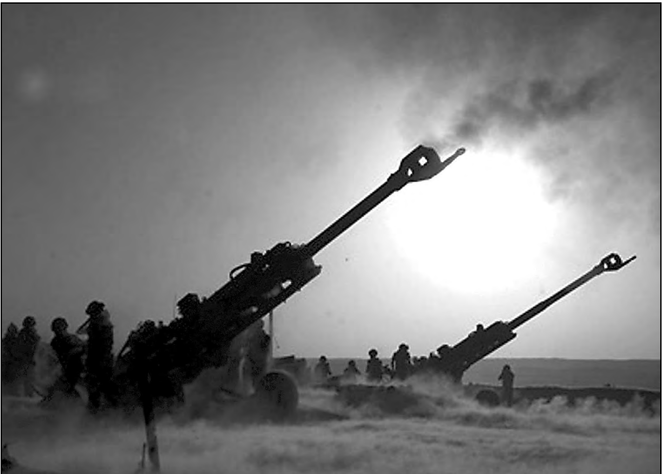
D Battery firing in Afghanistan.

In early February the members of D Battery boarded flights for their seven-month tour of duty in Afghanistan. As quickly as they could conduct a handover with E Battery they were dispersed across the southern end of the country, and tasked with providing fire support to the 2 RCR Battle group in fifty-two combat operations; twenty-three of which saw the guns fire in anger. In order to maximize the number of guns available for support at any given time, the Battery operated at the troop level for the majority of the tour. There are numerous challenges inherent to this type of deployment, and conditions were extremely austere. These deployments often extended past thirty days, particularly if our highly sought-after guns were deployed in support of British and American operations. This was often the case, as the long range abilities and accurate fire offered by the M777s were the envy of coalition forces. Equipment-wise this tour also boasted the new lightweight counter-mortar radar and artillery sound