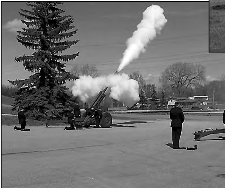
Gun salute in Swift Current, Saskatchewan.